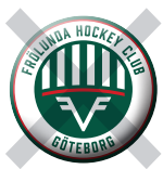
Don't use drop shadows or any other effects